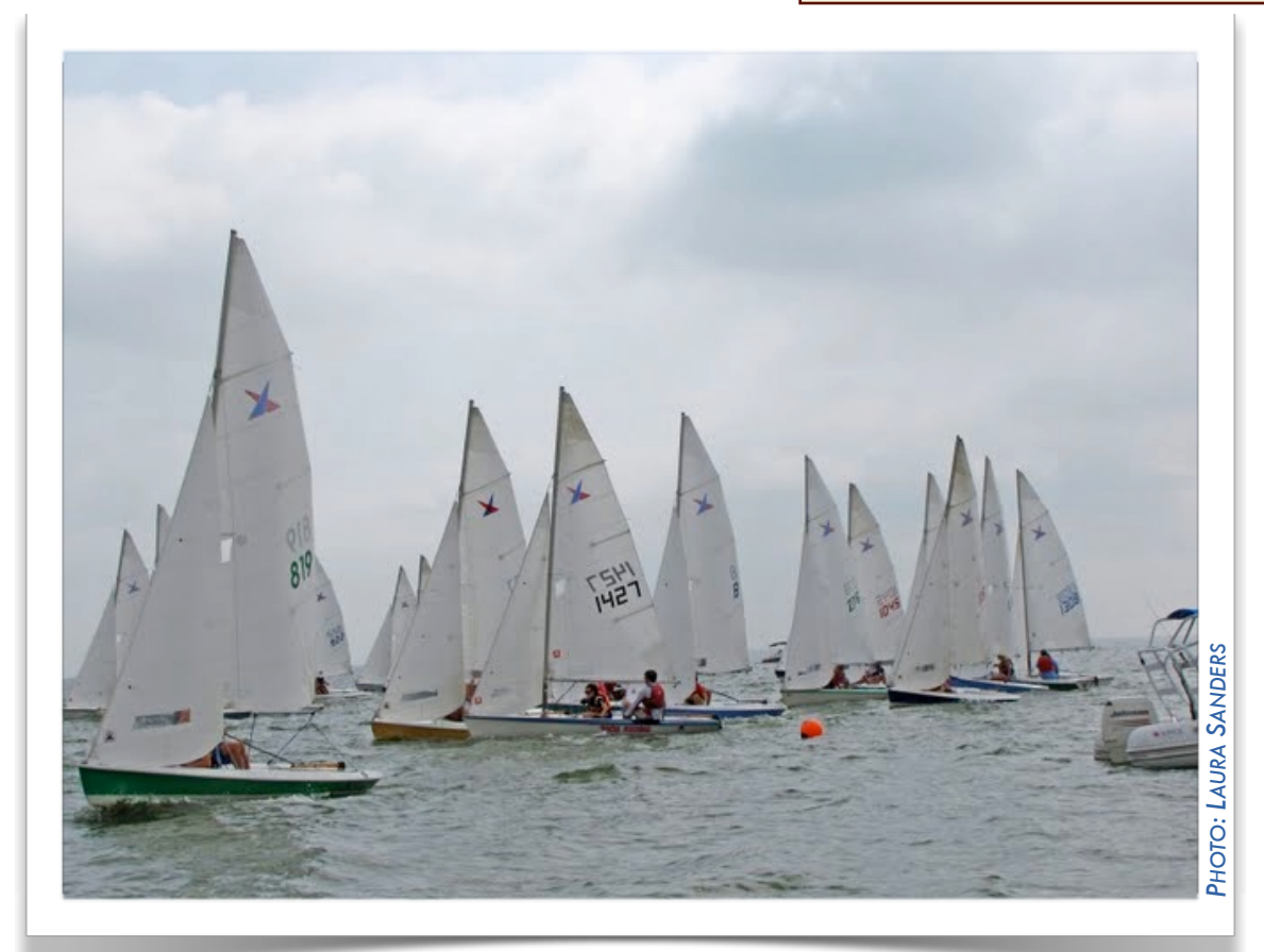
Saturday 19th September at the Galveston Bay Championship