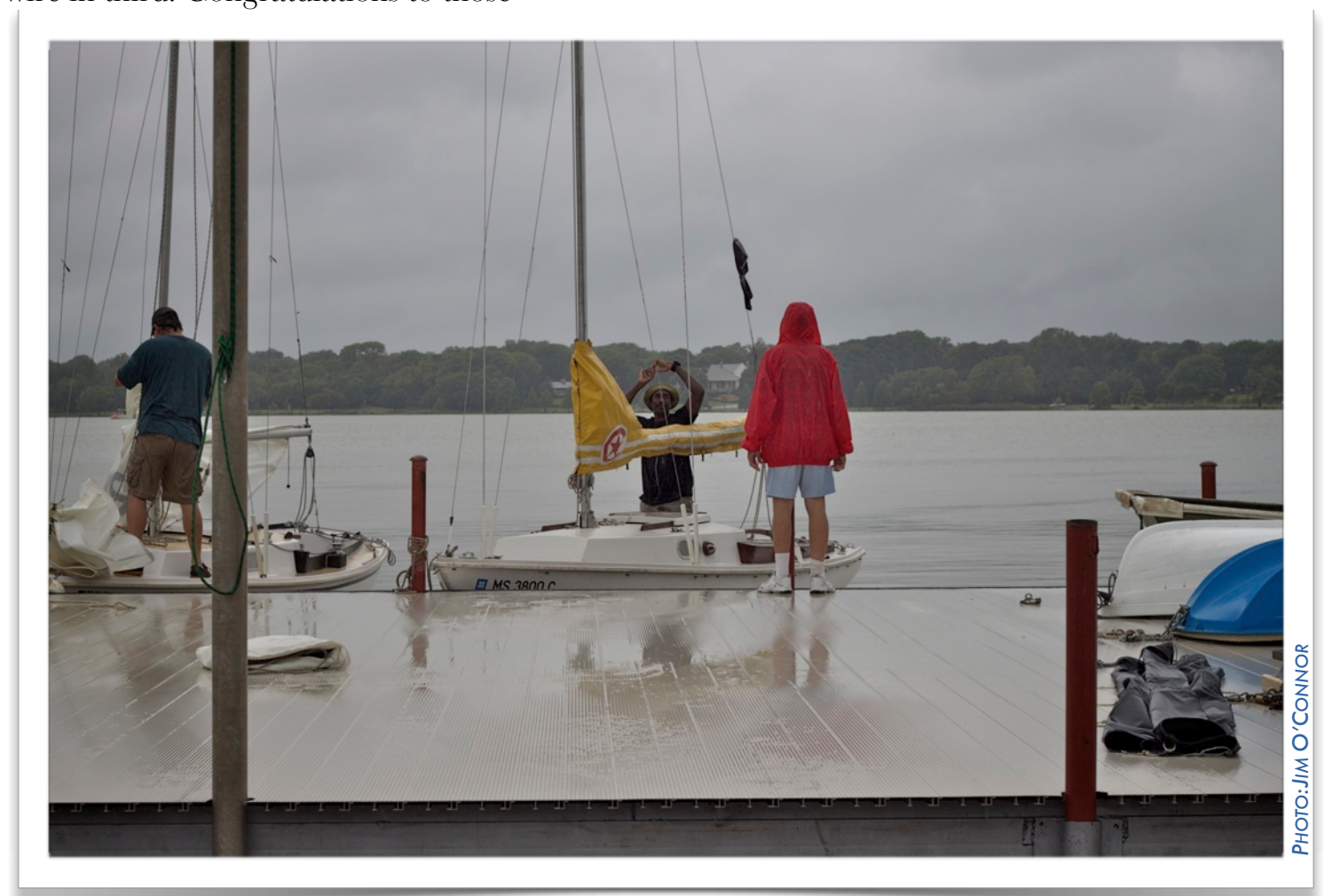
Saturday September 12th was a Wet Day

Again, thanks to all. Sail fast and see you on the Dock.