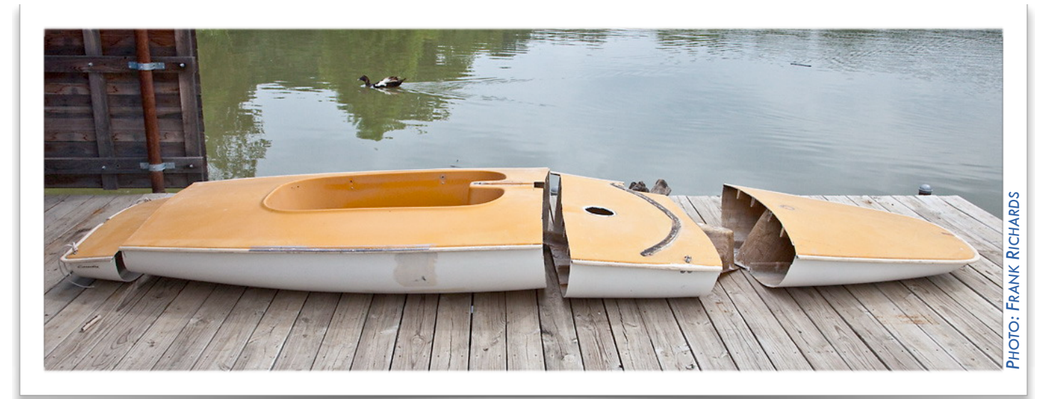
Can I borrow some duct tape?

Second, anatomy class: <a href="http://fleet20.blogspot.com/2006/09/butterfly-anatomy.html">http://fleet20.blogspot.com/2006/09/butterfly-anatomy.html</a>